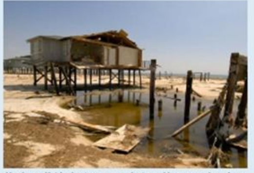
Hurricane Katrina's storm surge destroyed homes and roads on Dauphin Island in 2005.

Whether or not storms become more intense, coastal homes and infrastructure will flood more often as sea level rises, because storm surges will become higher as well. Rising sea level is likely to increase flood insurance rates, while more frequent storms could increase the deductible for wind damage in homeowner insurance policies. Many cities, roads, railways, ports, airports, and oil and gas facilities along the Gulf Coast are vulnerable to the combined impacts of storms and sea level rise. People may move from vulnerable coastal communities and stress the infrastructure of the communities that receive them.