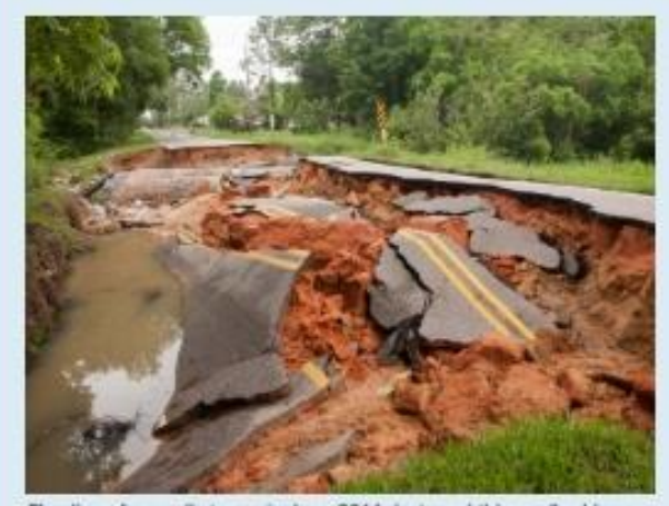
Flooding of a small stream in June 2014 destroyed this roadbed in Foley.

Droughts create a different set of challenges. When reservoirs release water for navigation along the Tennessee or Black Warrior rivers, too little water may be available for lake recreation or hydropower. Low flows from drought occasionally limit navigation along the Alabama River. During severe droughts in the Mississippi River's watershed, however, navigation can potentially increase on the Tennessee-Tombigbee Waterway, which provides an alternative route to the Gulf of Mexico.